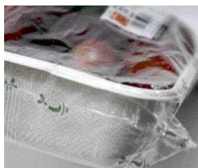
Biodegradable pack research