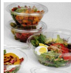
Food forum: 20-21 November

For more details contact Antony Hawman on 020 8267 4009, or email antony.hawman@haymarket.com .